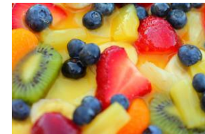
rainbow fruit salad