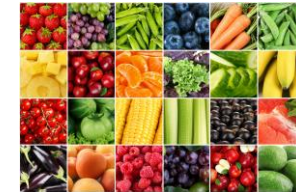
rainbow food collage